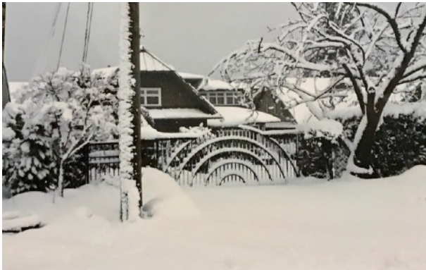
February, 2019

One day we'll look back on the Winter of 2019 and marvel how we managed to get through it.